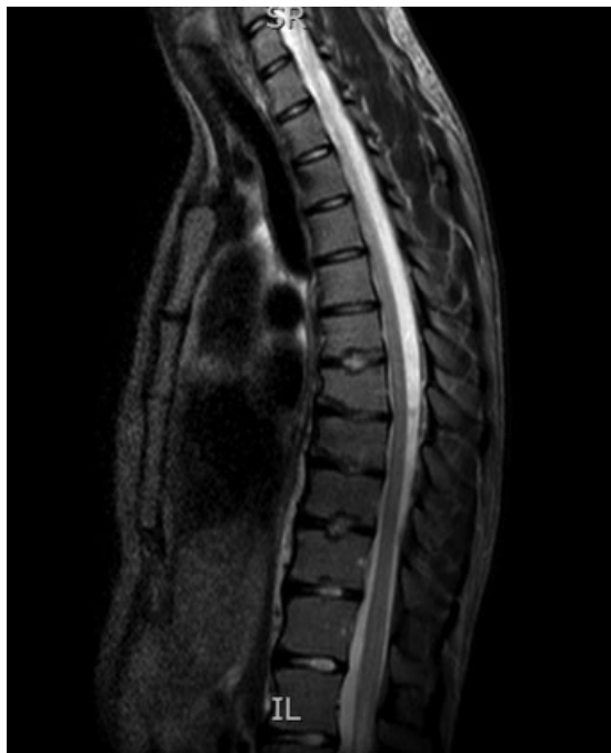
Fig. 2 Thoracic magnetic resonance imaging revealing multiple Schmorl's nodules and small disc herniation at T7–8.

a Kjaer et al (2005) reported intermediate/hypointense signal intensity and Tertti et al (1990) reported "abnormal discs"; these findings were determined to be indicative of degenerative disc disease and included in this category.