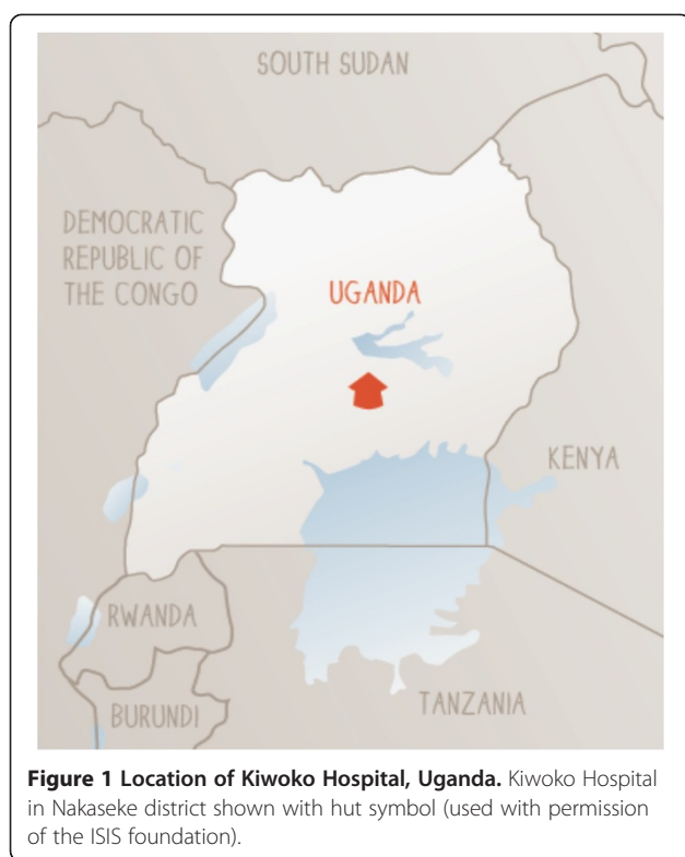
Figure 1 Location of Kiwoko Hospital, Uganda. Kiwoko Hospital in Nakaseke district shown with hut symbol.