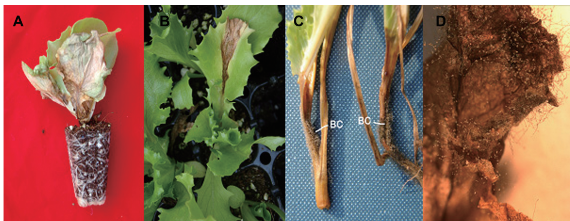
Fig. 2. Occurrence of gray mold disease symptoms caused by Botrytis cinerea after artificial inoculation (A, B). Sporulation of B. cinerea (BC) was observed on rotted stem and leaves (C, D).