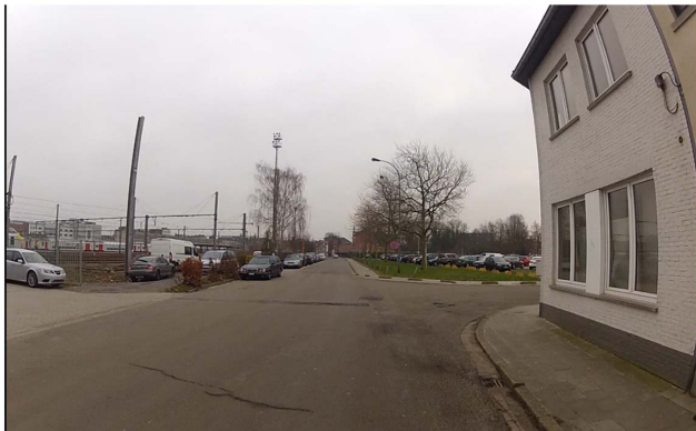
Figure 2. A situation where the view of oncoming traffic is impeded by the corner house.

Type of surface. Cobblestones, small pebbles or sand, but also tramways and manhole covers and uneven surfaces of the streets or cycle paths are elements that made it less comfortable and less appealing to cycle. Children were afraid of falling when cycling on certain surfaces, e.g. gutters with a slippery surface (see Figure 4) or tramways, especially in bad weather conditions.