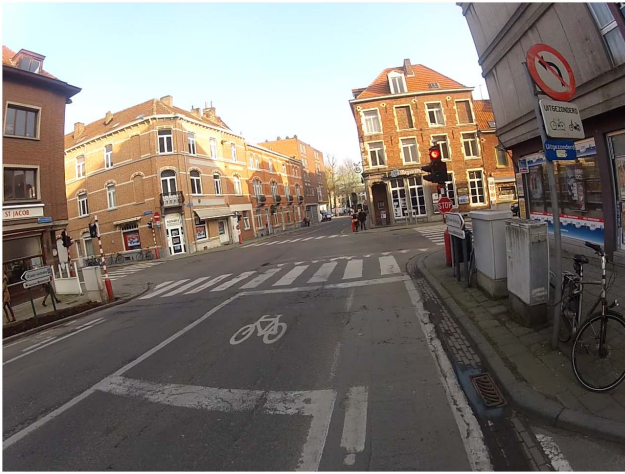
Figure 5. Participants liked bike boxes to cross roads, since they make cyclists visible before crossing roads. doi:10.1371/journal.pone.0106696.g005

was mentioned as essential to cycle in the evenings, due to parents' fears of stranger danger and the limited visibility of children.