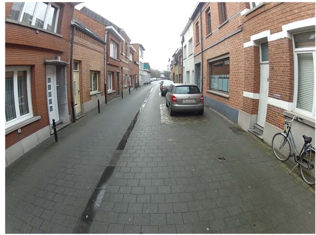
Figure 4. A slippery gutter in the middle of the road which was disliked by children. doi:10.1371/journal.pone.0106696.g004

Traffic signs. Parents were concerned about their children being not aware of the traffic rules and signs while cycling. Some children said that they did not pay attention to traffic signs, while