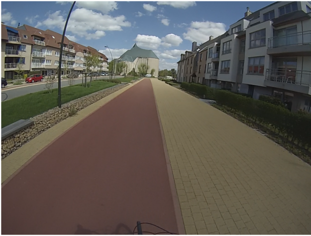
Figure 3. A good cycle path which is well separated from traffic, wide and without irregularities. doi:10.1371/journal.pone.0106696.g003

Crossings. Parents disliked their child having to cross roads, especially when it was unclear where cyclists needed to cross. Designated places to cross, such as crosswalks or bike boxes (see Figure 5), were therefore viewed favorably, since these infrastructures made cars alert of the presence of cyclists. The presence of traffic lights was considered a good way to create clarity about when cyclists may cross the road. However, parents felt that traffic lights should be properly adjusted so that it is clear to all road users who may cross. For example, different traffic lights for pedestrians and cyclists can make it unclear to cars when cyclists are allowed to cross.