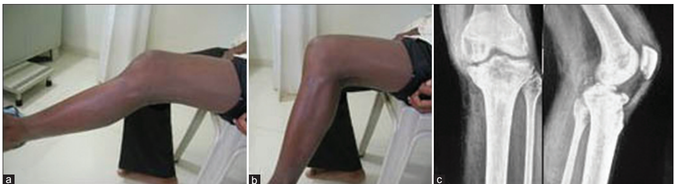
Figure 2: Clinical photographs (a and b) showing posterior subluxation of tibia and x-rays knee joint anteroposterior and lateral views (c) showing anterior tibial plateau fracture of a typical case, presenting late