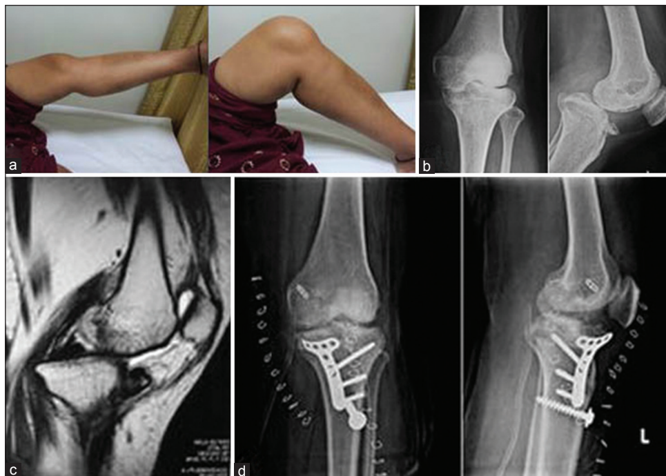
Figure 4: (a) clinical photographs of a patient presented late showing posterior sagging of tibia (b) X-rays of knee joint anteroposterior and lateral views showing tibial plateau injury (c) Sagittal MRI of same patient showing anterior tibial plateau injury (d) immediate postoperative x-ray of knee joint anteroposterior and lateral views showing implant in situ with reduction achieved

Lately, Luo et al. proposed, based on computed tomography (CT) evaluation, the concept of three-column in the treatment of tibial condyle fractures, where three columns were medial, lateral and posterior. 6