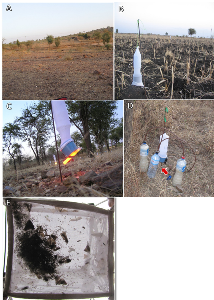
Figure 1 (A-C) Field work in, Tigray, Northern Ethiopia: A) Rocky plain with sparse vegetation near the village of Ademeiti. B) Deeply cracked vertisol in a fallow sorghum field near the village of Gueza Meker showing a 3 V CDC trap. C) Sparse woodland near the village of Erdweyane with a 3 V trap baited with red light-stick. Note up-draft orientation of the traps. D) A 3 V CDC trap, baited with sugar-yeast mixture (SYM) producing CO 2 as attractant. Note two bottles filled with SYM joined via an empty bottle serving to catch foam. Arrow points to the CO 2 outlet under the trap which is deployed in the up-draft orientation. E) Typical catch of a down-draft 6 V incandescent light trap in Sheraro. To process and separate the sand flies from the rest of the insects in such catches can take up to an hour.

Experiments were conducted using CDC type suction traps deployed in the up-draft orientation with their opening about 15 cm above ground level. Suction traps deployed in the inverted (=updraft) orientation were