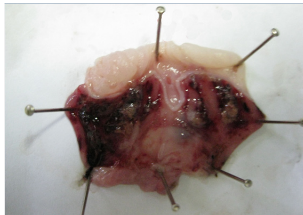
Figure 2. Severe gastric erosions, ulcers and hemorrhage induced by ethanol in rat after 14 days (negative control group treated by saline).

some agents such as indomethacin, alcohol, and aspirin produce oxygen free radicals and enhance lipid peroxidation (23). A powerful relationship has been observed between lipid peroxidation and ulcer formation in the stomach (24). Ethanol induces gastric damages through the oxidative stress and producing of reactive oxygen species (25). Results of our study indicated the hydro-alcoholic extract of Q. brantii extract decreased