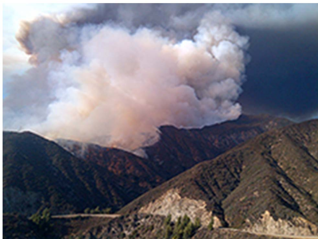
Figure 1. Photograph of the 2012 Williams Fire in Angeles National Forest, California showing the relatively remote and mountainous terrain where the fire occurred. doi:10.1371/journal.pone.0107835.g001

et al. [15] and Dunlap et al. [1], who predicted that it could take decades to centuries to flush leaded gasoline depositions from surface sediments in California’s Central Valley to San Francisco Bay. Similarly, Semlali et al. [16], based on a study in France, estimated that it would take at least 700 years to reduce the amount of anthropogenic Pb accumulated in soil by 50%.