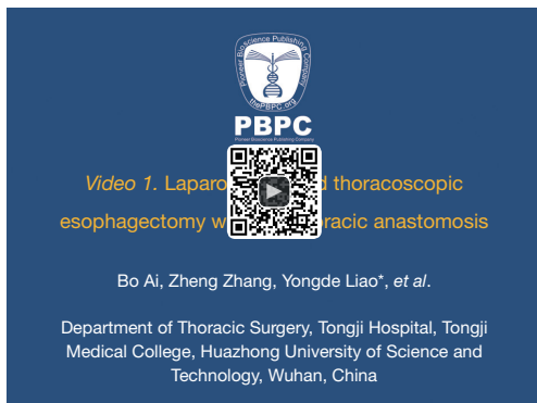
Figure S1 Laparoscopic and thoracoscopic esophagectomy with intrathoracic anastomosis (12): (I) laparoscopic mobilization of the stomach; (II) thoracoscopic mobilization of thoracic segment of esophagus and tumor; (III) purse-string suture and insertion of the stapler anvil; (IV) intrathoracic anastomosis; (V) tension-relieving suture of the anastomotic stoma, embedded with pedicled omental flap. Available online: http://www.asvide.com/articles/282