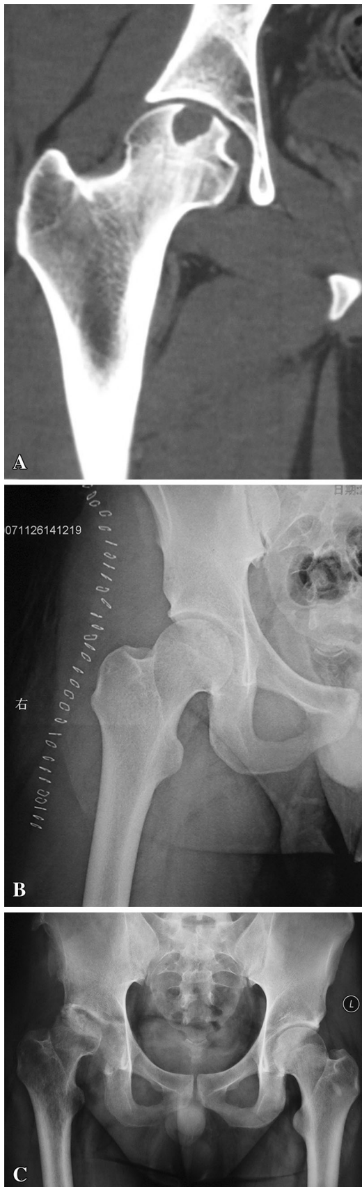
◀ Fig. 2A–C A 20-year-old man had a chondroblastoma of the femoral head treated with our modified trapdoor technique. (A) His coronal CT scan shows a round osteolytic lesion with a thick sclerotic rim. (B) A postoperative radiograph shows the bone defect after curettage is well grafted. (C) The 7-month postoperative radiograph shows the typical appearance of femoral head collapse with signs of osteoarthritic change.

space between the pelvis and the end of the femur as less than 1 cm. The patient was asymptomatic and hip movement was not compromised. No additional surgical intervention was done.