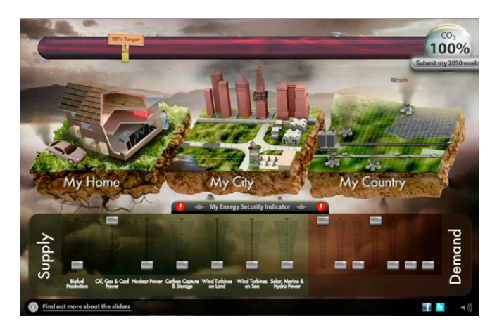
Fig. 2. The my2050 scenario-building tool illustrating the seven supply-side sliders (contains public sector information licensed under the United Kingdom's Open Government License v2.0).

The my2050 tool represents a simplified version of a detailed 2050 energy system calculator (34) for the United Kingdom, also developed by DECC. Piloting had shown that many members of the general public did not find the overly technical graphs, language, and operation of the full calculator engaging. The my2050 tool that we eventually adopted (available online at http://mv2050. decc.gov.uk) (35) by contrast has a more user-friendly interface and simplified structure, but nevertheless encompasses many of the supply- and demand-side changes of plausible transitions.