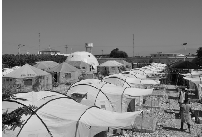
FIGURE 1. The GHESKIO MDR-TB Field Hospital established after the earthquake of January 12, 2010.

Patients were hospitalized in individual tents (Figure 1) during the initial phase of treatment for 3–8 months to ensure optimal treatment response, monitor closely for signs of toxicity, and reinforce adherence. Adverse drug effects of grade 3 or higher were noted. HIV-positive patients who