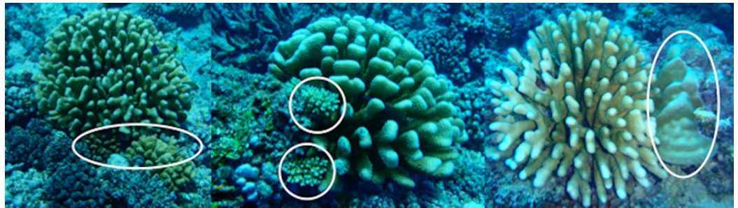
Figure 3 Examples of corals sheltered by living Pocillopora eydouxi and Trapezia flavopunctata .

Both significantly reduced the frequency of attack and volume of tissue consumed by Culcita , but T. serenei was more effective. This may be because T. serenei is more common in the back reef habitat where Culcita populations are most dense, while T. bidentata is more common in fore reef environments where Culcita is less frequently encountered in Mo'orea.