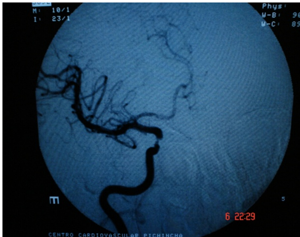
Figure 3. Cerebral angiography of right carotid shows significant and eccentric decrease in the caliber of supraclinoid segment of right internal carotid artery.