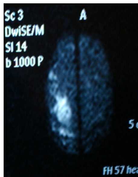
Figure 2. Diffusion-weighted MRI reveals a right cortical hyperintense image that corresponds to an acute cortical infarction.

Traumatic ICAD is suspected and diagnosed when neurological symptoms occur unexpectedly after a trauma. TICAD evolves into stroke in 80% of cases within the first week of the trauma. The common cause of stroke is