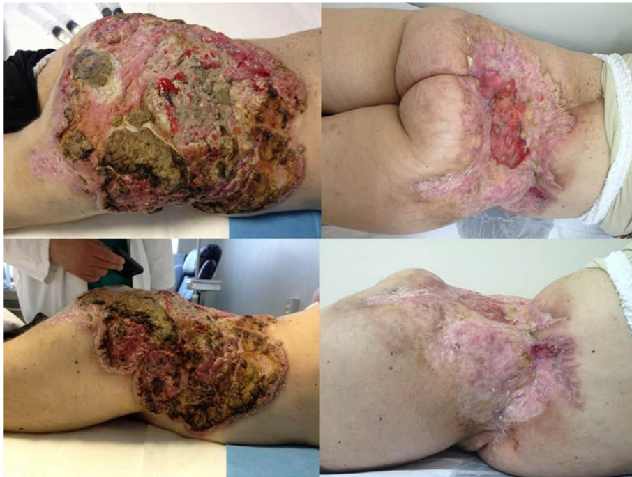
Figure 1 On left the lesion at baseline (March 2012) and on right the lesion at follow up (October 2013).

Quality of life resulted significantly, dramatically improved with progressive reduction until discontinuation of anti-pain drugs. At follow up of 15 months there was no evidence of active disease, moreover she was able to get back a normal social life. Actually the ECOG Performance Status is 0 (zero).