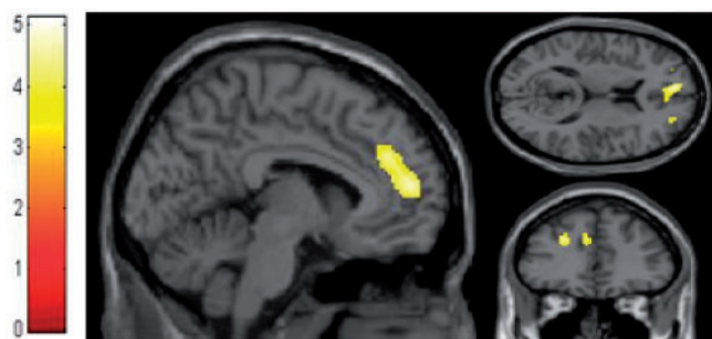
Fig. 2 Brain-behavior correlation between anosognosia discrepancy scores and FDG-PET images in AD patients compared to elderly controls shows significant hypometabolism in the dMPFC. Images are displayed in the Montreal Neurological Institute (MNI) space. SPM displayed at P < 0.0005 uncorrected.

The stereotactic coordinates refer to the MNI space. AD and EC refer to Alzheimer's patients and elderly control subjects. The SPM(T) maps were thresholded at P < 0.0005 at peak level and P_{\text{FWE}} < 0.05 at cluster level.