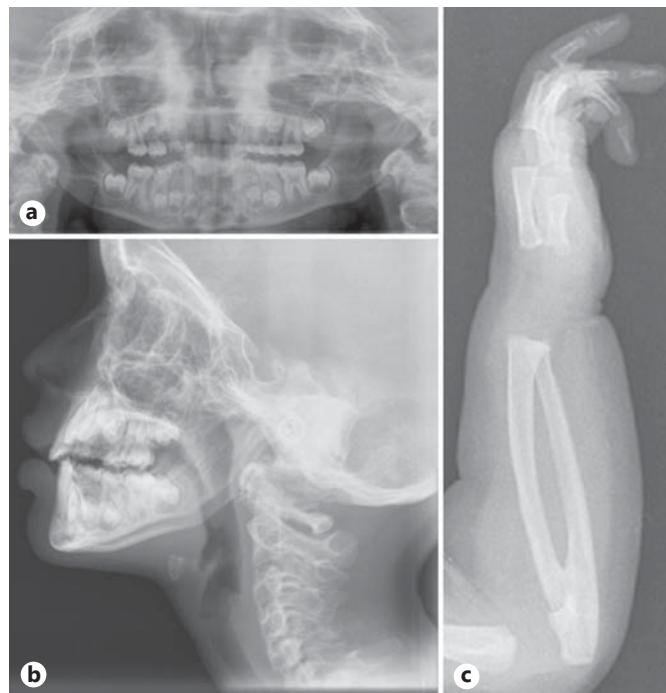
Fig. 2. a Orthopantomogram showing radiculomegaly with open apices. b Lateral cephalometric radiograph. c Lateral left elbow radiograph (at infancy) showing radioulnar synostosis.

We obtained clinical data and blood samples from the 2 affected sisters and their parents. In addition, buccal swabs and saliva were received from the mother and the father, respectively. Clinical data and samples were obtained with informed consent, including consent to use the photographs in this report, under protocols approved by the Institutional Review Board.