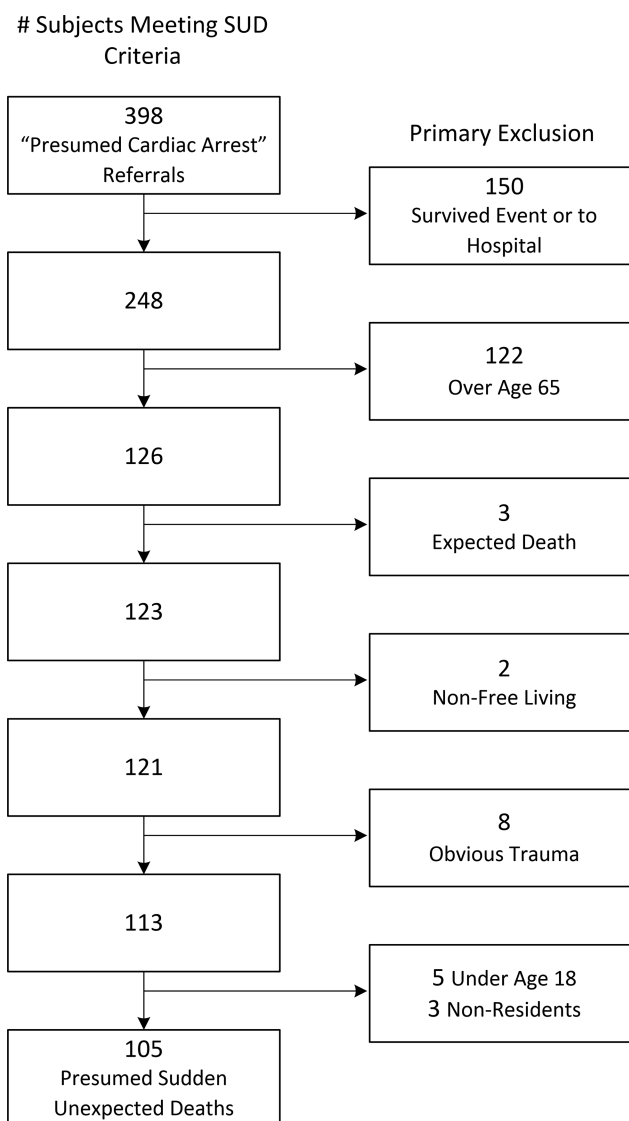
Figure 2 Exclusion criteria and number of referrals meeting primary exclusion. This figure shows the order of the sequential exclusion criteria and the number of referrals meeting each criterion for referrals received from 1 March to 29 June 2013 (SUD, sudden unexpected death).

The screening process identified 105 of 398 referrals as presumed SUD participants. Demographic data were collected from the NC Department of Health Statistics for these participants. Demographic data were collected for all Wake County deaths between the ages of 18 and 65 years, the control group, during the same time frame. The control group had an average age of death of 52.5 years (95% CI 51.4 to 53.5) and the presumed SUD group had an average age of death of 49 years (95% CI 47.5 to 52.2). There was a higher percentage of males in the presumed SUD group than in the control group, 67.6% (95% CI 58% to 76%) and 58.9% (95% CI 46% to 55%), respectively.