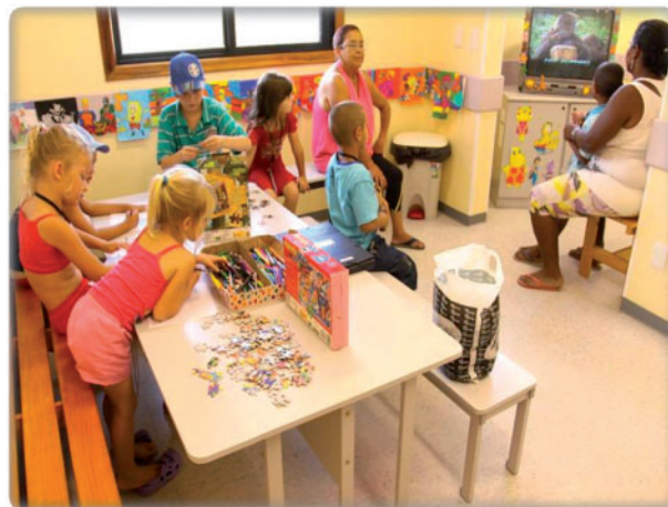
Figure 2. Children of the 2004 Cohort at the recreation room during the fifth follow-up (2010-11).

Joint analyses of the cohort data are welcome and we have collaborated successfully with investigators from the UK (University of Bristol) and with Chile and Mexico through a Latin American cohorts consortium. Exchange of doctoral or postdoctoral fellows between other institutions and Pelotas is very welcome. For young researchers from low- and middle-income countries, there are sponsored postgraduate positions available on a competitive basis. Since 2005, a Wellcome Trust-supported programme has trained 25 MSc and PhD students from Latin America