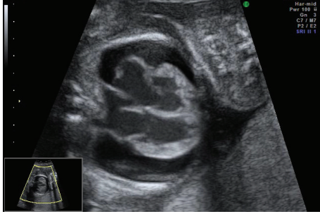
FIGURE 1: Fetal echocardiography at 21 weeks of gestation. A 2D image of the four-chamber view showed cardiomegaly, dilated ventricles, and atria with thickened and echo-dense walls, as well as massive pericardial effusion.

edema, massive pericardial effusion, mild cardiomegaly, and ventricular hypertrophy. Doppler studies showed a high peak systolic velocity in the middle cerebral artery (MCA) of 61.41 cm/s (2.28 MoM) suggestive of fetal anemia. Doppler investigations showed reverse flows in the MCA and ductus venosus (DV) with umbilical venous pulsation. Fetal echocardiography showed cardiomegaly (cardiothoracic area ratio; CTAR 45%) resulting in severe regurgitation of all valves and impaired ventricular function without structural cardiac defects. The endocardium was echo-dense, suggesting the presence of fibroelastosis (Figure 1).