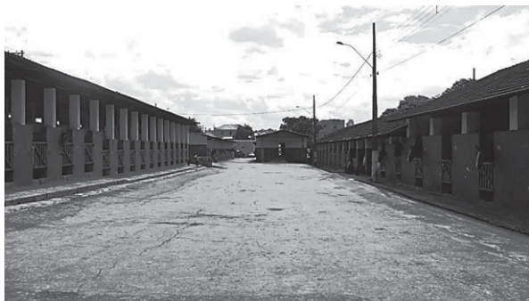
Figure 2. Overview of the stables belonging to the military police of Minas Gerais, Belo Horizonte, Brazil.

We found a positive and significant medium-strength correlation between bite mark frequency and the incidence of colic ( r_s = 0.548 , N = 46 , p < 0.001 ); likewise the lameness rate had a weakly positive relationship with the length of scratch marks ( r_s = 0.272 , N = 46 , p = 0.004 ).