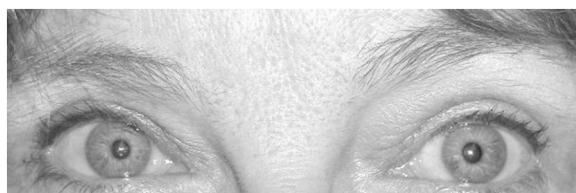
Figure 4 Patient 2. Asymmetries: MPD = 0 mm; CED = 5.5 mm; NED = 6 mm; TED = 3.5 mm.

0.66), 1.34 mm (95% CI 1.14-1.54), 1.78 mm (95% CI 1.49-2.07), and 1.77 mm (95% CI 1.46-2.07), respectively.