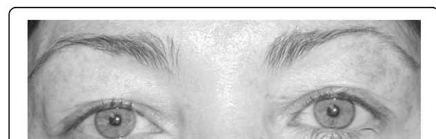
Figure 3 Patient 1. Asymmetries: MPD = 0 mm; CED = 1.5 mm; NED = 1.5 mm; TED = 4 mm.

Figure 2 reports the average asymmetry, in millimeters, for each of the four measurements. The average MPD, NED, TED and CED were 0.55 mm (95% CI 0.44-