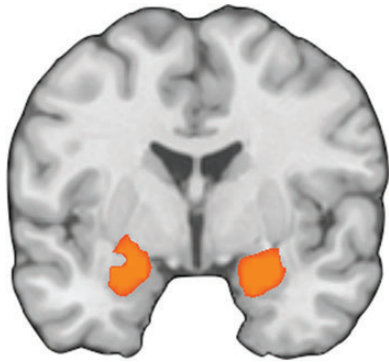
Figure 2. Results of the meta-analysis of brain regions modulated by reappraisal ( \gamma = -3 ; emotional baseline > reappraise).