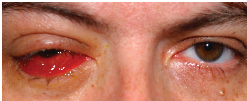
Figure 1 Colour photograph of the face demonstrating congestion, chemosis, and proptosis of the right eye with soft-tissue swelling of the upper and lower lid.