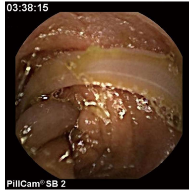
Figure 3 Capsule endoscopy. Capsule endoscopy shows a single roundworm moving in the jejunum. There appears to be more than one worm body. However, movement of each part of a body able to be visualized was coordinated. A single worm of Ascaris infection was diagnosed.