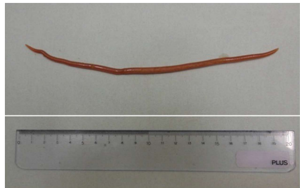
Figure 4 Excreted Ascaris lumbricoides after treatment. A single worm of Ascaris lumbricoides was excreted the day after treatment of pyrantel pamoate. The worm length was approximately 20 cm.

made by ultrasound examination and capsule endoscopy.