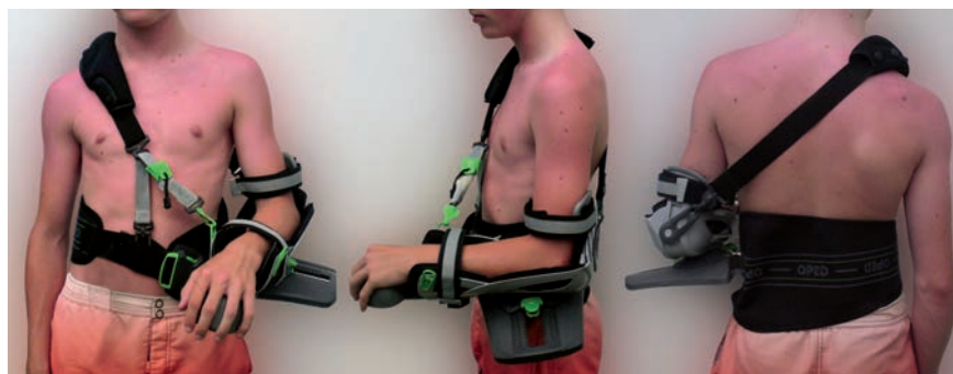
Figure 2. Non-operative treatment using an abduction brace allowing partial unloading in 15° shoulder abduction and 45° internal rotation. Furthermore, mobilization with passive rotation can be conducted from week 4 within the brace.