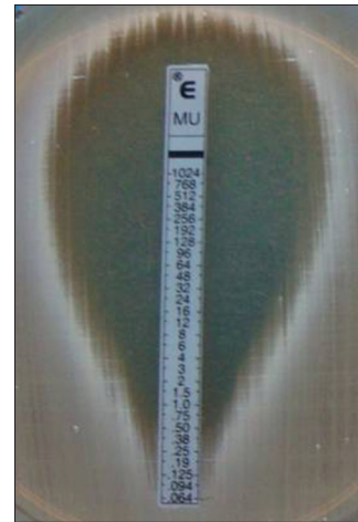
Figure 2: Interpretation of mupirocin E-test