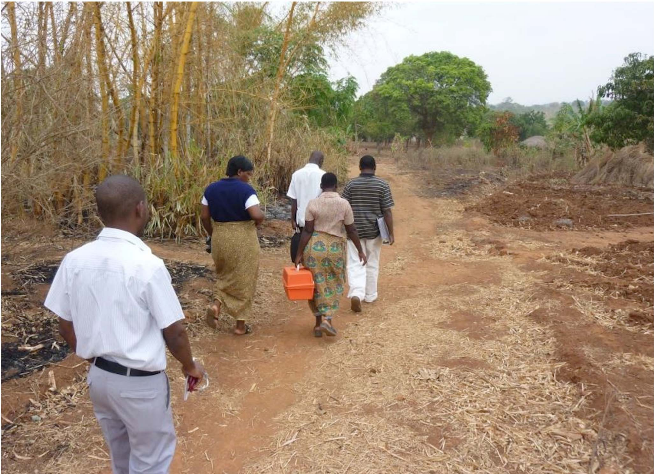
Figure 3. Neno Palliative Care Program team members conduct a home visit in a rural village. Five members of the Neno Palliative Care Program (NPCP) team travel by foot to reach the home of a palliative care patient living in rural Neno district, Malawi. An Abwenzi Pa Za Umoyo/Partners In Health Medical Officer with specialized training in palliative care (foreground) leads the home visit. He is accompanied by (from left to right) a palliative care nurse, a Program on Social and Economic Rights social worker, a Village Health Worker and a NPCP clerk. NPCP team members work together to assess and treat patient pain and other physical symptoms, provide disease-specific care for serious chronic illnesses, and offer psychosocial support to patients and their families. doi:10.1371/journal.pone.0110457.g003

over the follow-up interval. We recorded 4 deaths (6%) that occurred before the patient's first scheduled follow-up encounter, each transpiring within 1 month of program enrollment (Table 4).