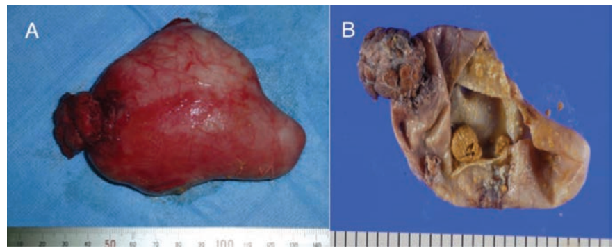
Figure 2. Surgical specimen. A) Lateral view of the cyst. B) Cross-section of the cyst. The cystic tumor comprised brown secretory material and a dark brown firm mass.