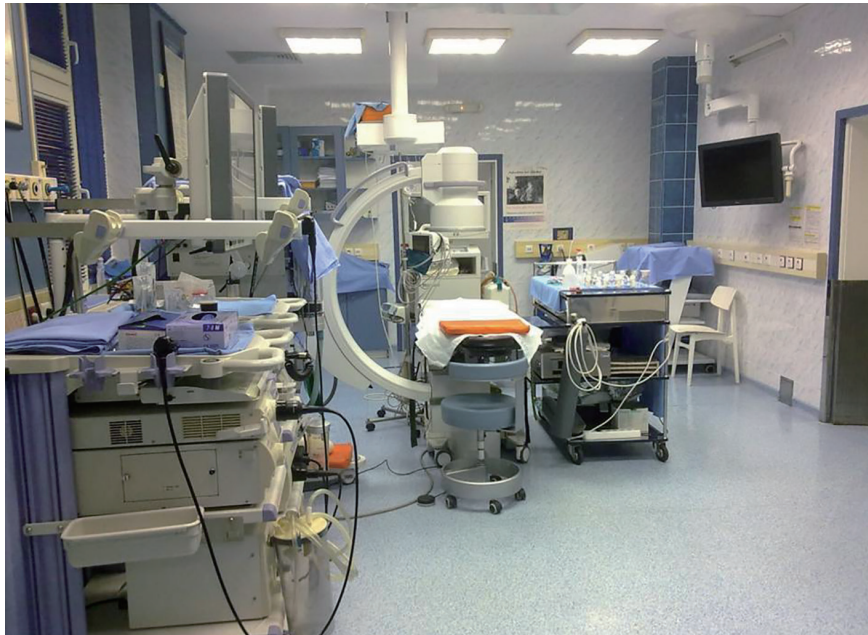
Figure 1 A bronchoscopy suite.

flexible bronchoscopy, the most common indications are those conditions in which histopathology is important in therapeutic decision making, such as lung transplantation and rare or unusual parenchymal lung diseases. Diagnostic and staging information in the presence of malignancy in mediastinal lymph nodes, are also indications for TBNB.