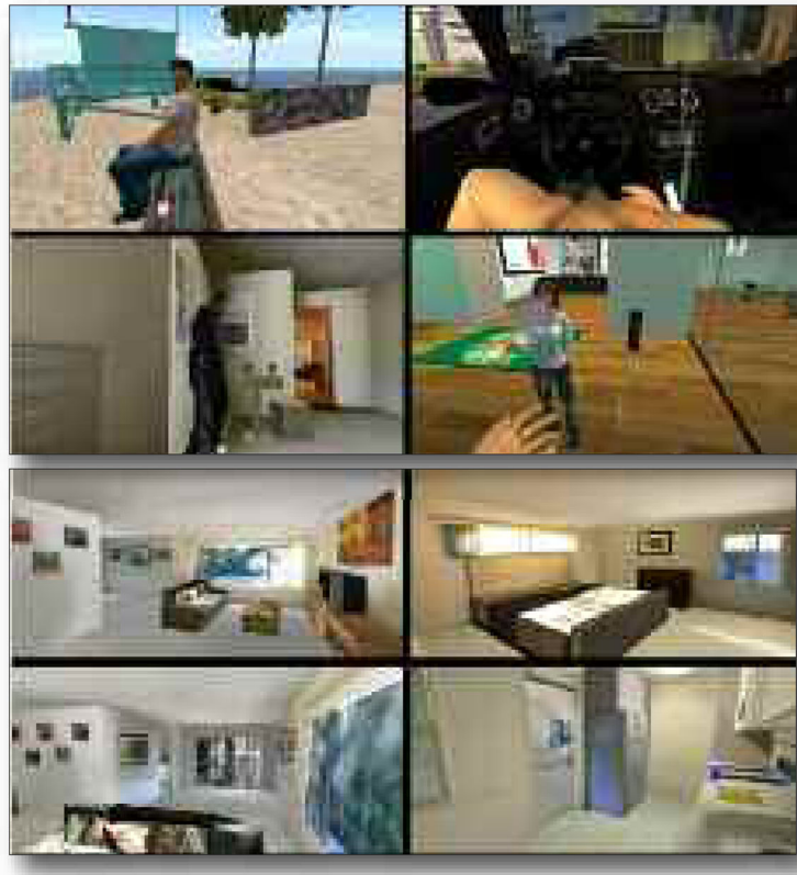
Figure 1. Screenshots from the smoking-related virtual reality cue environment (smoking-VR) on top and placebo-related.