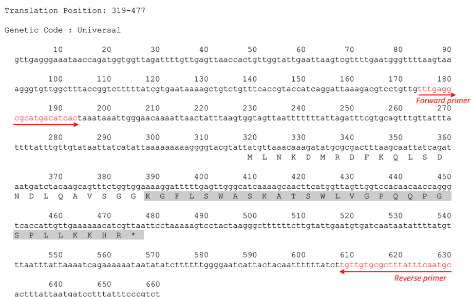
Figure 1 Nucleotide sequence of the weissellicin L gene and the deduced amino acid sequence. An asterisk indicates the translation stop site. The mature weissellicin L peptide is highlighted in grey.

The activity of a dedicated ATP-binding cassette (ABC) transporter is required for the secretion of many class II bacteriocin in Gram-positive bacteria (Michiels et al. 2001). A double-glycine-type leader could always be observed with two glycine residues located at positions -1 and -2 of the leader peptides. This double-glycine sequence is a hallmark of the class II bacteriocins exported through ABC transporters (Dimov et al. 2005; Michiels et al. 2001). In this study, the double-glycine-type leader sequence