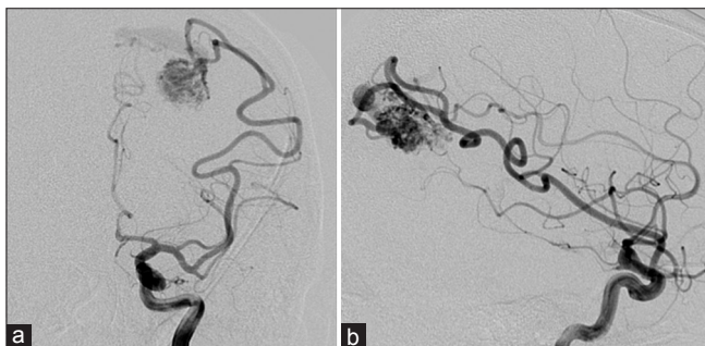
Figure 3: AP (a) and Lateral (b) left internal carotid injections demonstrating left parietal AVM

AVM without complication or morbidity. Postoperative cerebral angiography demonstrated no residual AVM nidus or early venous drainage. The hospital course was unremarkable and the patient was discharged home on postoperative day three. At 6 months follow-up, the patient remained seizure free and not on antiepileptic medications.