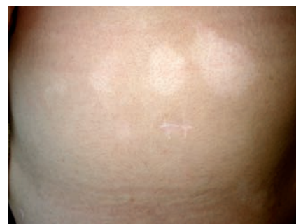
Figure 1. Depigmented patches on the back.

The pathogenesis of MAS is not clear yet. Environmental triggers and genetic susceptibility have been proposed to be involved. 2,4,5 Autoimmunity has been proposed to be a prominent