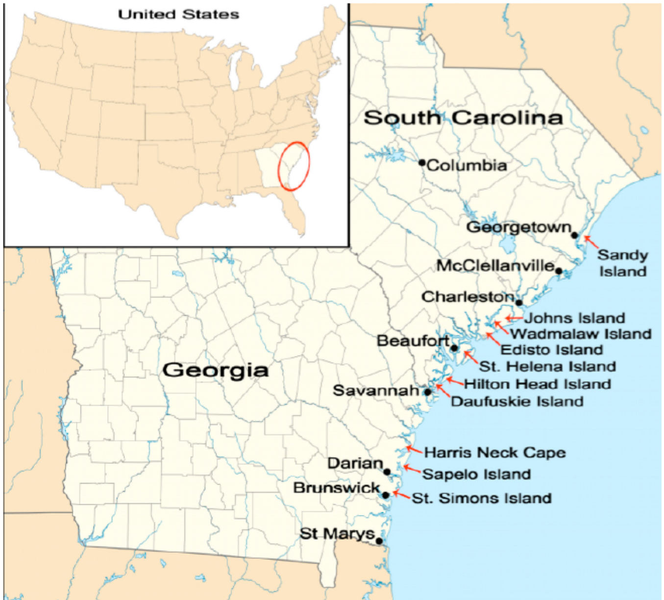
Figure 2. Sea Islands of South Carolina and Georgia (the 'low country' region). Map drawing courtesy of Jennifer B. Lessard