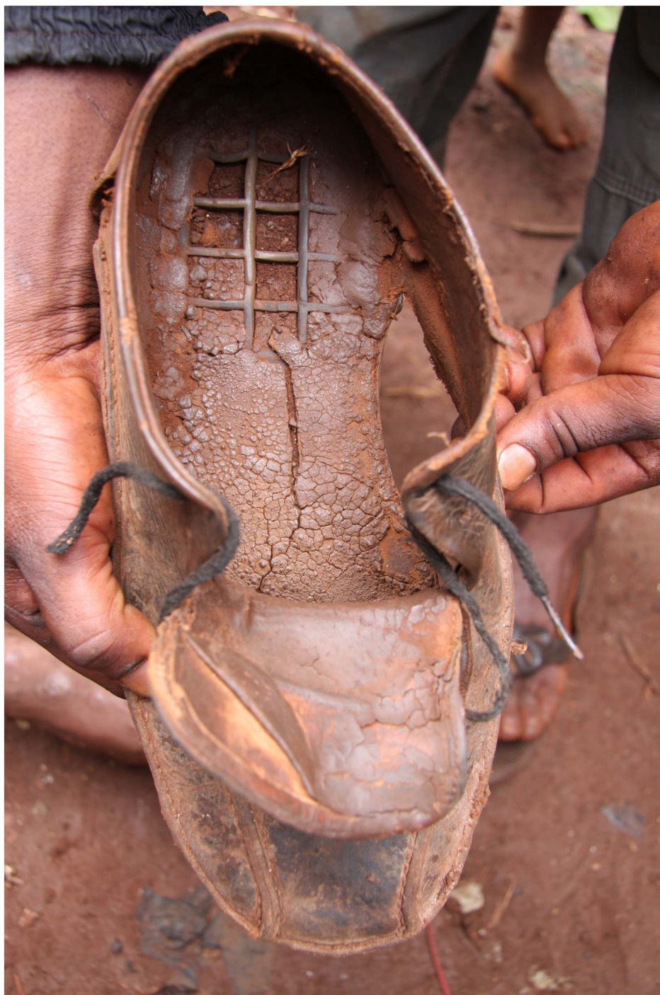
Figure 3. Shoe of an adolescent from rural Kenya after 6 months of use. doi:10.1371/journal.pntd.0003133.g003

tungiasis is reported are low-income and lower middle-income economies where this plague afflicts the same marginalized population segments and communities affected by the already-recognized NTDs. The same inequity issues and complex social determinants as in the field of the NTDs have perpetuated the transmission of tungiasis in resource-poor communities