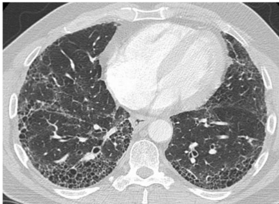
Figure 1 HRCT cross-sectional view showing a pattern of peripheral reticulation and honeycomb change that is diagnostic of the presence of UIP.

areas with extensive fibrosis. In addition to total and differential BAL cell counts, BAL fluid and sediment can be analyzed for infection or the presence of malignant cells, and the gross appearance of freshly retrieved BAL fluid may provide diagnostic information (e.g. progressively increasing blood in sequential aliquots that is seen with diffuse alveolar hemorrhage or white-tan discoloration of the BAL fluid with rapidly settling tan sediment [due to gravity] that can be seen with pulmonary