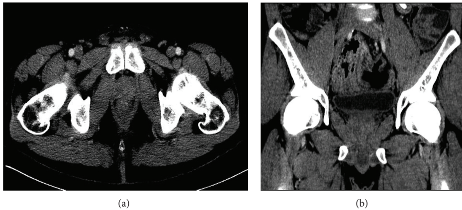
FIGURE 2: Axial (a) and coronal (b) views of CT abdomen and pelvis with contrast after completion of 6 weeks of intravenous antibiotic therapy showing resolution of prostatic abscess.

differential diagnosis after detecting MRSA in the urine should include pyelonephritis, renal abscess, prostate abscess, endocarditis, skin infection, or staphylococcal bacteremia originating from another site [3, 7, 9]. MRSA bacteremia can be the origin or the consequence of a prostatic abscess. In our case, further investigation to identify the origin of the bacteremia, including careful history, physical examination, and echocardiogram, was negative except for the presence of the prostatic abscess.