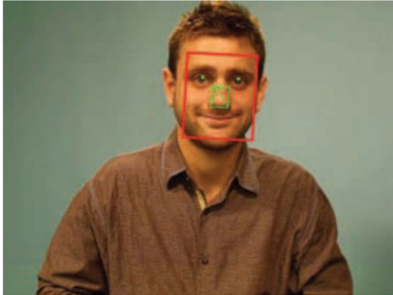
Figure 3. CSIRO Head Pose Tracking [20]