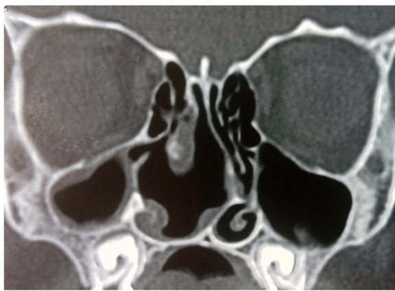
Figure 2 Coronal paranasal sinus computed tomography images 2 months after the operation showing no signs of recurrence or inflammation.

Mucoceles are mucus-filled, epithelial-lined sacs that occur in paranasal sinuses. They are benign lesions that gradually expand via bony reabsorption and erosion with resultant new bone formation [4].