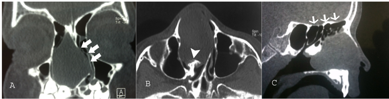
Figure 1 Coronal (A), axial (B), and sagittal (B,C) paranasal sinus computed tomography images showing a mucocoele of the nasal cavity. (A) Coronal image showing the extensive mucocoele filling the nasal cavity without orbital extension. The nasal septum has deviated to the left side due to the mass effect (white arrows). (B) Axial image showing the originating site of the mucocoele from the middle concha (white arrowhead). (C) Sagittal image of the mucocoele. Note that the cranial base is intact without extension into the cranial fossa (thin white arrows).

roof, or septum. His right nasal cavity was packed with NASOPORE® (a biodegradable/fragmentable, synthetic polyurethane foam; Polyganics, Groningen, The Netherlands), which was aspirated on the tenth postoperative day. The postoperative period was uneventful without any complications or synechia formation. His nasal obstruction improved remarkably in the immediate postoperative period. A postoperative HRCT examination was performed 2 months after surgery. There were no signs of recurrence or inflammation (Figure 2). Histopathology revealed a benign cyst lined by ciliated columnar mucin-secreting cells with no secondary changes due to infection or hemorrhage (Figure 3). On follow-up, he was disease free at the end of 18 months.