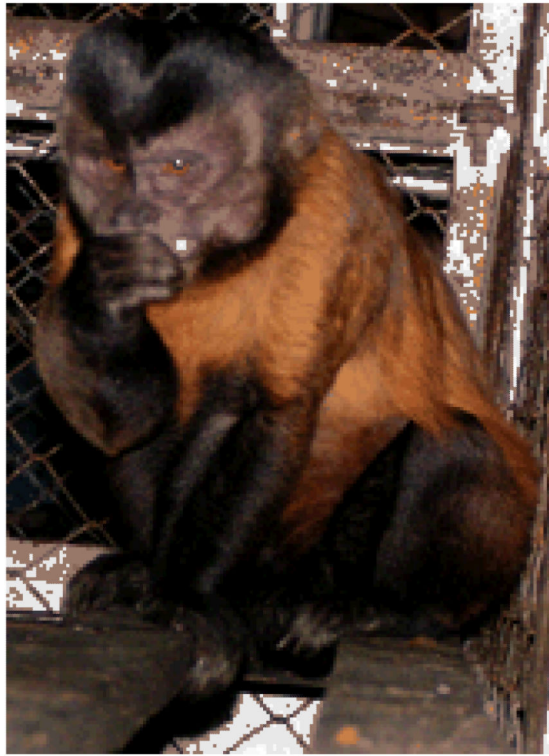
Figure 1. Raul (M14), an adult male capuchin monkey.