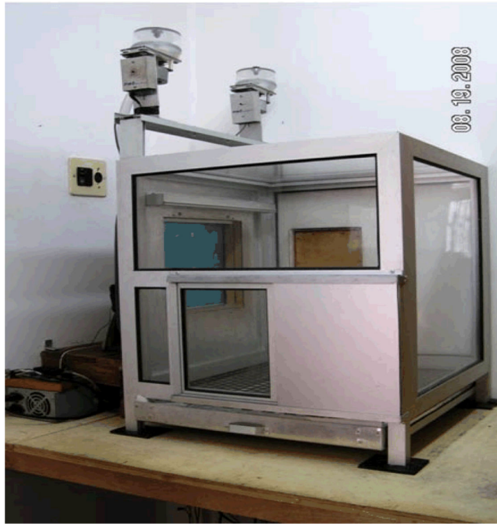
Figure 2. Experimental chamber with touch screen and pellet dispenser.