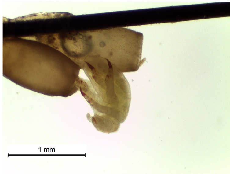
Figure 2 Haematopinus tuberculatus : hatching phase of a nit with the emergence of a nymph.