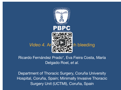
Figure 4 Arterial branch bleeding (7).

Available online: http://www.asvide.com/articles/341