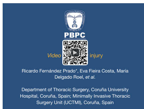
Figure 11 Airway injury (14). Available online: http://www.asvide.com/articles/351