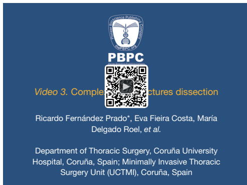
Figure 3 Complex hilar structures dissection (5).

Available online: http://www.asvide.com/articles/345