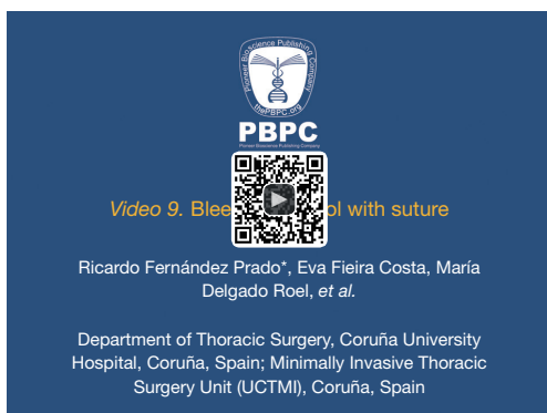
Figure 9 Bleeding control with suture (12). Available online: http://www.asvide.com/articles/349

often be avoided. For example, during the performance of an upper lobectomy, one of the branches can be injured (Figure 9). After compression, the mediastinal trunk was dissected and controlled, so the tear was sutured.