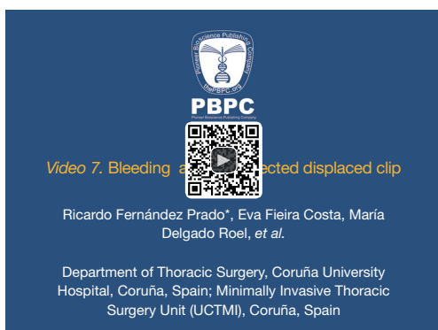
Figure 7 Bleeding after unexpected displaced clip (10). Available online: http://www.asvide.com/articles/347