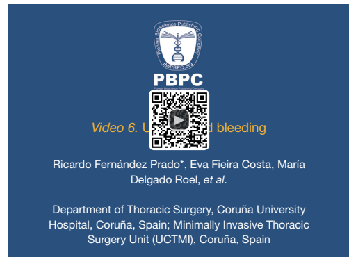
Figure 6 Unexpected bleeding (9).

Available online: http://www.asvide.com/articles/343