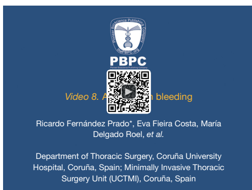
Figure 8 Azygos vein bleeding (11). Available online: http://www.asvide.com/articles/348