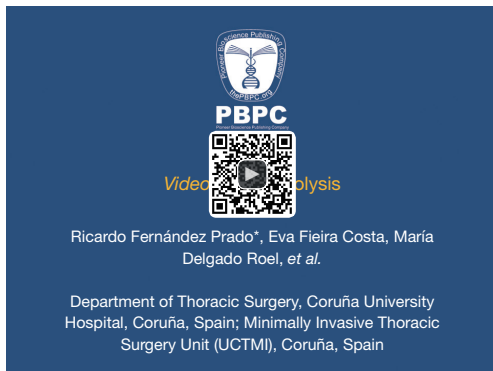
Figure 2 Adhesiolysis (4).

Available online: http://www.asvide.com/articles/344