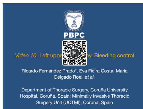
Figure 10 Left upper lobectomy. Bleeding control (13). Available online: http://www.asvide.com/articles/350