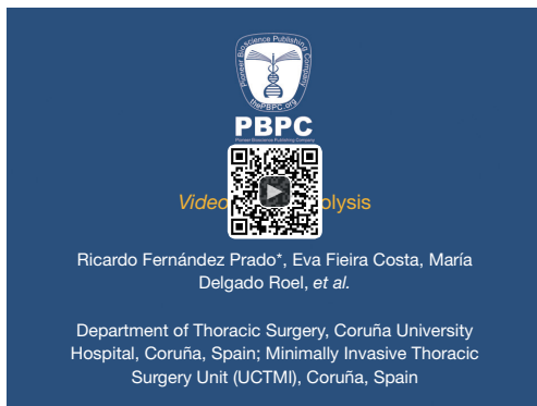
Figure 1 Adhesiolysis (3).

Available online: http://www.asvide.com/articles/341