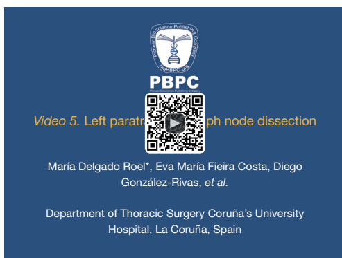
Figure 5 Left paratracheal lymph node dissection (9). Available online: http://www.asvide.com/articles/340

exposes the subcarinal space and the anti-trendelenburg position which exposes the paratracheal area.