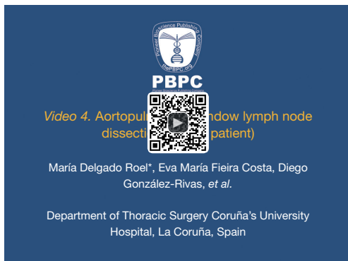
Figure 4 Aortopulmonary window lymph node dissection (awake patient) (8). Available online: http://www.asvide.com/articles/339