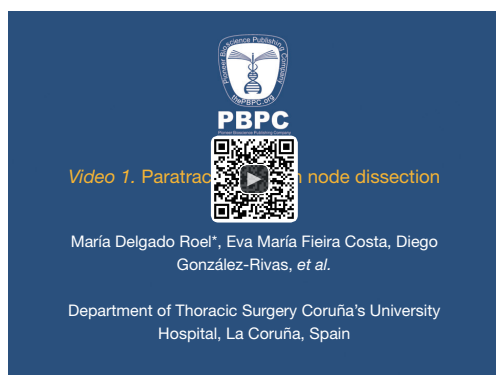
Figure 1 Paratracheal lymph node dissection (5).

Available online: http://www.asvide.com/articles/336