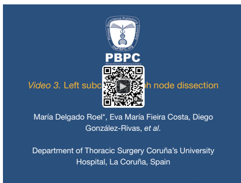
Figure 3 Left subcarinal lymph node dissection (7). Available online: http://www.asvide.com/articles/338