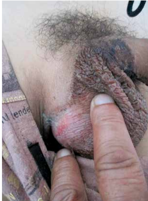
Figure 3. Scrotal and perineal erythema and erosions

Pellagra was diagnosed clinically and histopathologically. Half-and-half nail was diagnosed clinically. Isoniazid (INH) treatment was not discontinued and 900 mg of nicotinamide per day was started. Topical mometasone furoate cream, multivitamin, and adequate nutritional intake were parts of the treatment as well. The pellagra-re-