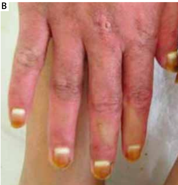
Figure 4. Half-and-half nail

Pellagra was diagnosed clinically and histopathologically. Half-and-half nail was diagnosed clinically. Isoniazid (INH) treatment was not discontinued and 900 mg of nicotinamide per day was started. Topical mometasone furoate cream, multivitamin, and adequate nutritional intake were parts of the treatment as well. The pellagra-re-