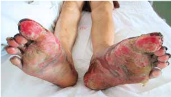
Figure 2. Visible bulla on the dorsum of his feet, erosion, exudation plaque on pelma