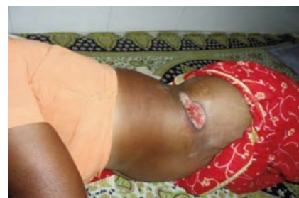
Figure 1. Picture showing malignant skin ulcer along waist line.

cycles of chemotherapy with paclitaxel and carboplatin before proceeding to surgical management. After thorough diagnostic work up and preoperative evaluation she underwent wide local excision 1 cm margin with primary skin grafting. Histopathological examination of the specimen confirmed diagnosis of squamous cell carcinoma with tumor free surgical margins moderately differentiated of grade II with T 3 N 1 M 0 stage III. Post operative period was uneventful. After recovery we proceeded with concomitant chemotherapy with cisplatin and radiotherapy. Our patient tolerated well this management throughout complete course without any adverse event. Now she in remission state for last 2 years from the completion of treatment.