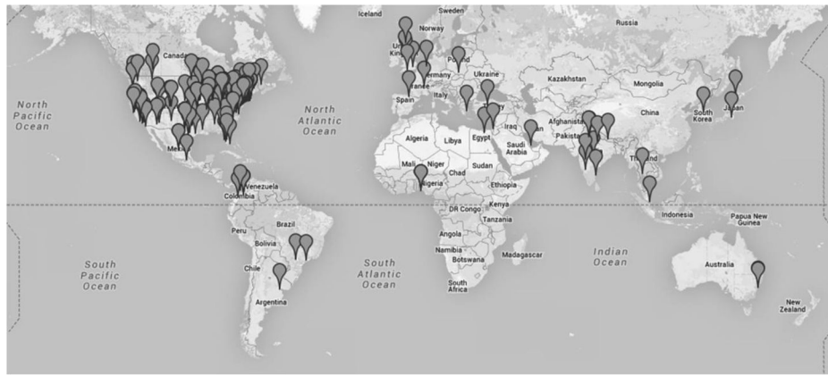
FIGURE 2. Geographic location of institutions participating in the Society for Healthcare Epidemiology of America (SHEA) Research Network.