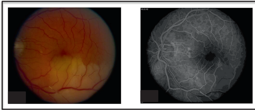
Figure 1 The fundus photograph demonstrates multiple Hollenhorst plaques and an area of retinal edema in the left eye. The fluorescein angiogram highlights inferior vascular filling defects.