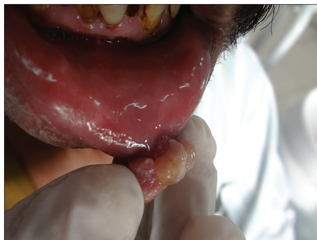
Figure 2: Exophytic growth showing the pedunculation