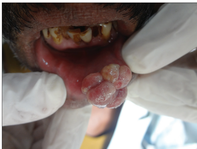
Figure 1: A lobulated exophytic growth on the mucosal surface of the lower lip