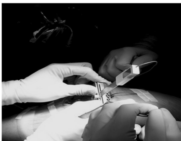
Figure 2 Use of electromagnetic CAS-MIS-TKA to guide the resection of the distal femur.

Both groups had the same postoperative pain control and rehabilitation consisting of a multimodal approach, which aims to avoid parenteral narcotics and early postoperative mobilization. Perioperative parameters (operative