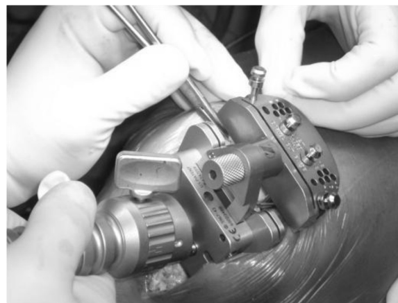
Figure 3 Minimally invasive total knee arthroplasty (MIS-TKA) using an intramedullary cutting guide to resect the distal femur.